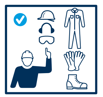
Proper clothes and personal protection equipment e.g. gloves and safety shoes must be worn.