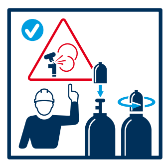
Cylinder valves must be protected against damage by screwing on cylinder caps.