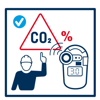
Use portable \rm CO_2 detectors that can indicate the \rm CO_2 content.

A carbon dioxide cylinder contains a liquefied gas under pressure. It may rupture (or burst) if heated or in case the container is overfilled resulting hydraulically full. The filling ratio of common gases is usually regulated by local legislation.